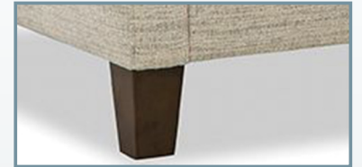
2 Tapered Leg