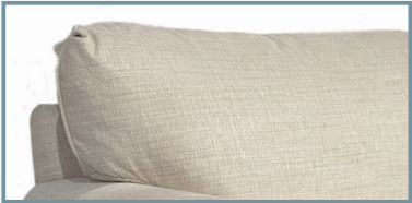
2 Loose Knife Edge