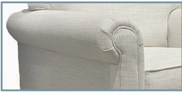
1 Panel Arm

1 CHOOSE YOUR ARM 2 CHOOSE YOUR BACK 3 CHOOSE YOUR WELT 4 CHOOSE YOUR BASE