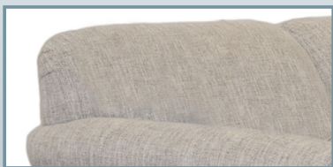
5 Tight Back