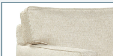
3 Semi- Attached Box Back