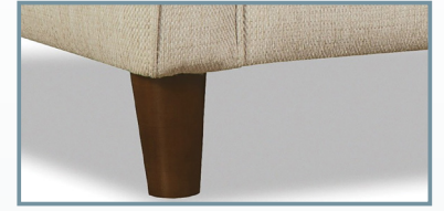
1 Conical Leg