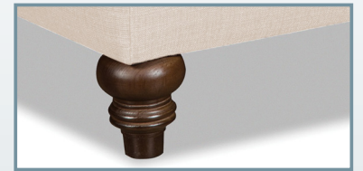
3 Turned Leg