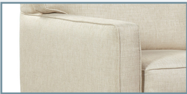
3 Track Arm