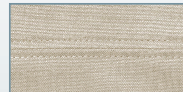
3 Saddle Stitch/ Double Needle