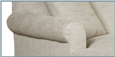
2 Sock Arm