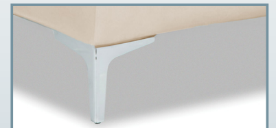
4 Metal Leg (Polished Steel)