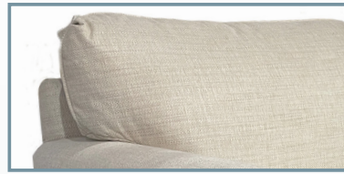
1 Semi-Attached Knife Edge