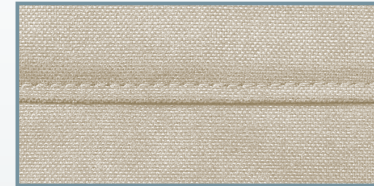
2 French Seam/ Single Needle