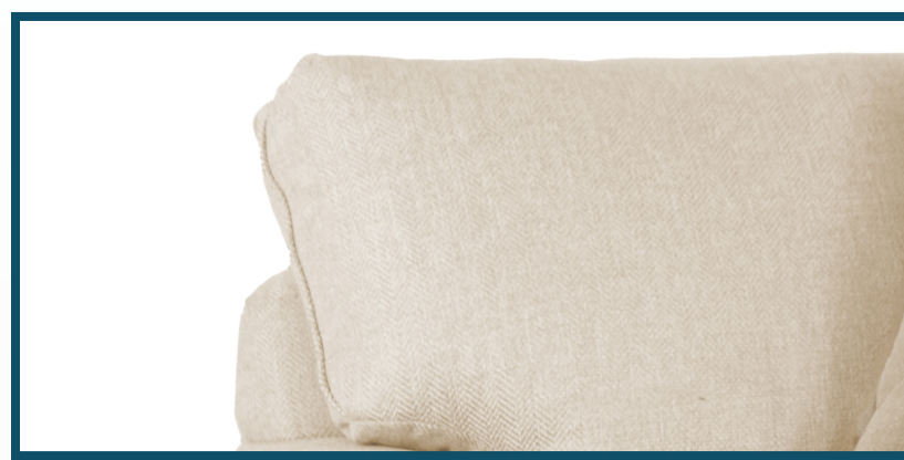
1 Semi-Attached Knife Edge Back