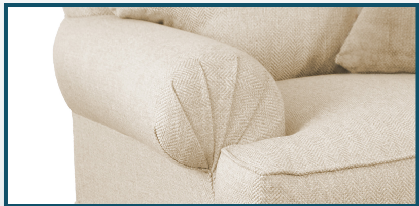
3 Pleated arm